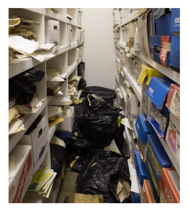
FIGURE 1 THE ARCHIVE ROOM BEFORE THE PROJECT