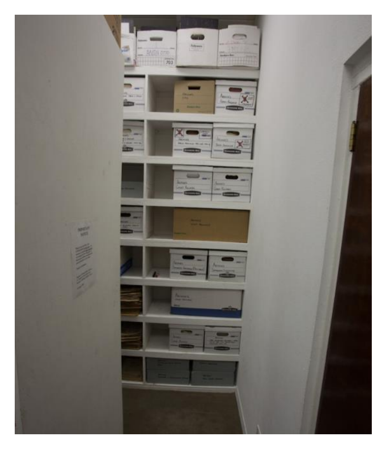
FIGURE 2 THE ARCHIVE ROOM AFTER THE PROJECT