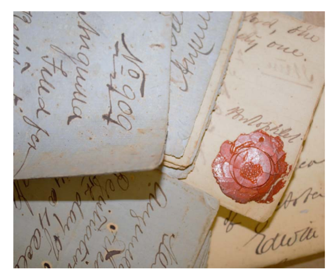
FIGURE 5 19TH CENTURY WILLS