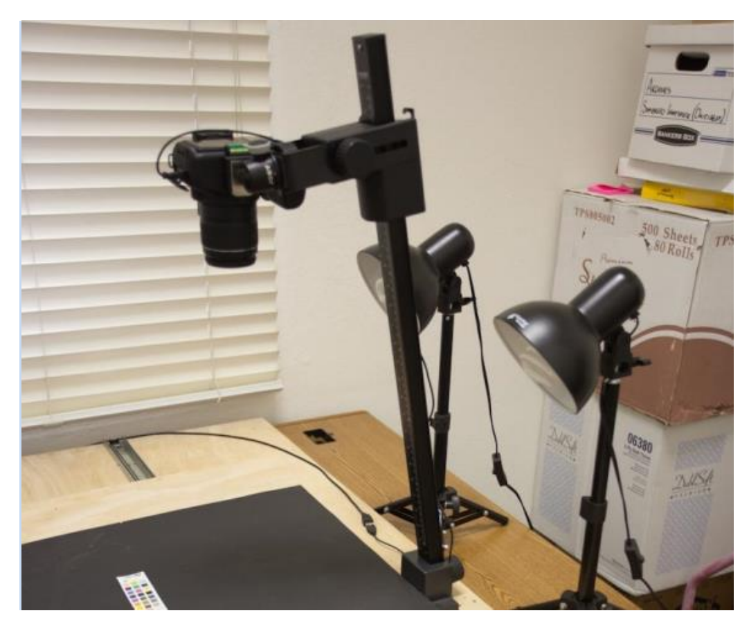
FIGURE 3 EQUIPMENT SETUP